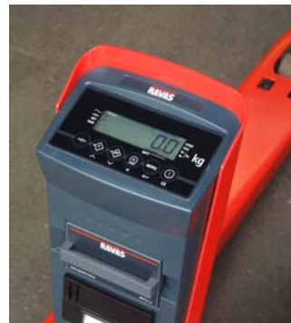
User-friendly digital indicator