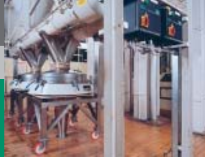
Compact 900 screeners with Vibrasonic deblinding system at Colmans - mustard powder producer. The screens are fed from blenders and pass the sieved material through to the packaging area.