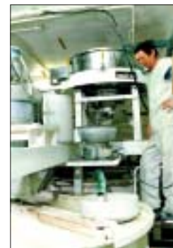
Compact Sieves are suitable for screening wet materials as shown here at Royal Crown Derby.

different materials of construction, different grades of finish, explosion-proof motors, debinding systems and many more.