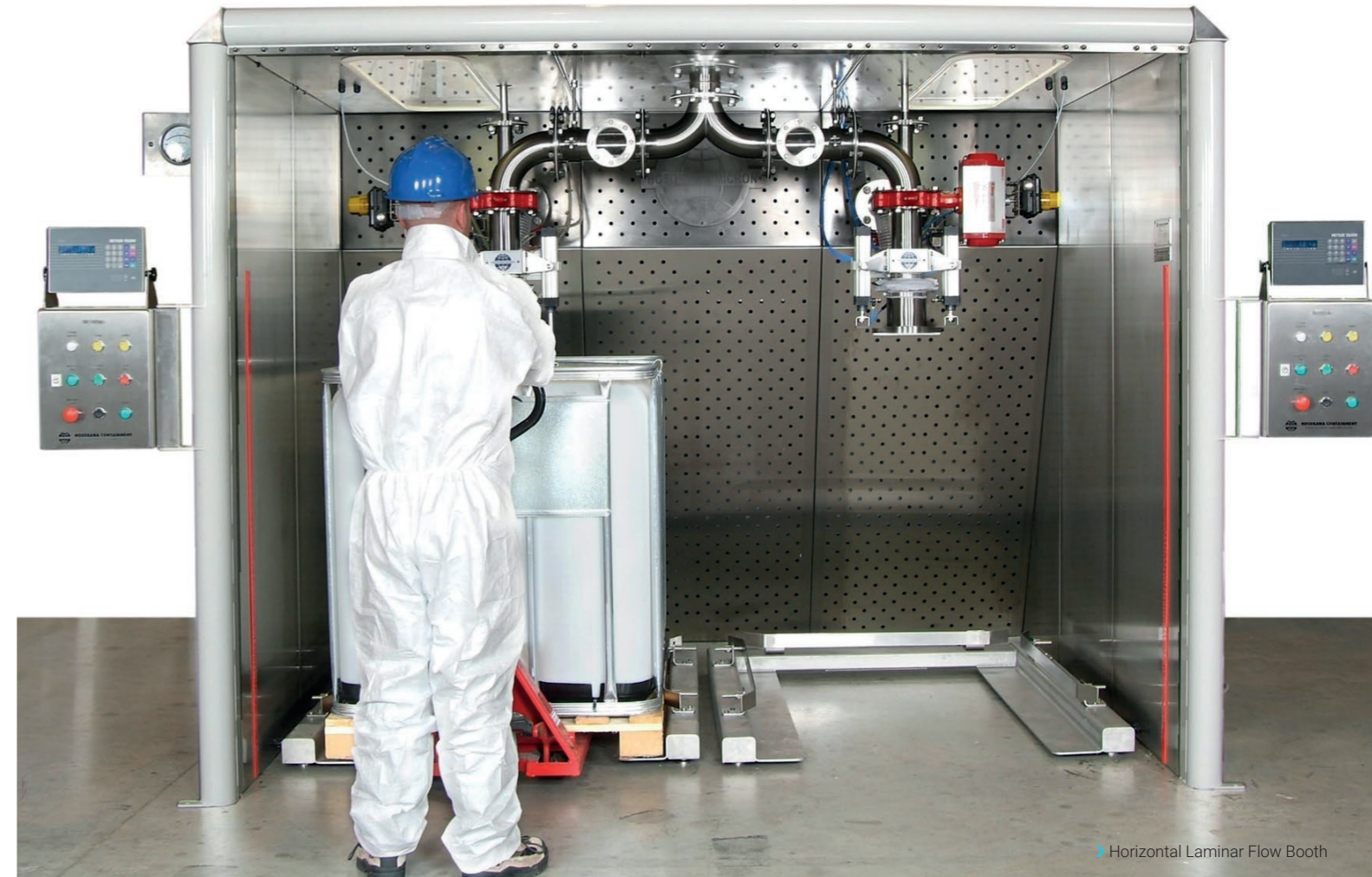
Horizontal Laminar Flow Booth