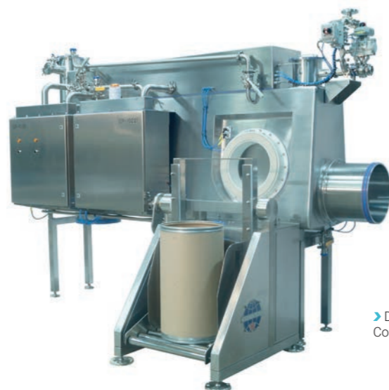
› Drum and Bulk Container Equipment

From drum tipping for precise powder handling, to versatile IBC/ drum filling for powders and liquids, efficient IBC/FIBC discharging for powders and advanced drum emptying with vacuum discharge, suitable for powder and liquid materials, Hosokawa Micron offers a range of tailor-made solutions to complement our containment equipment.