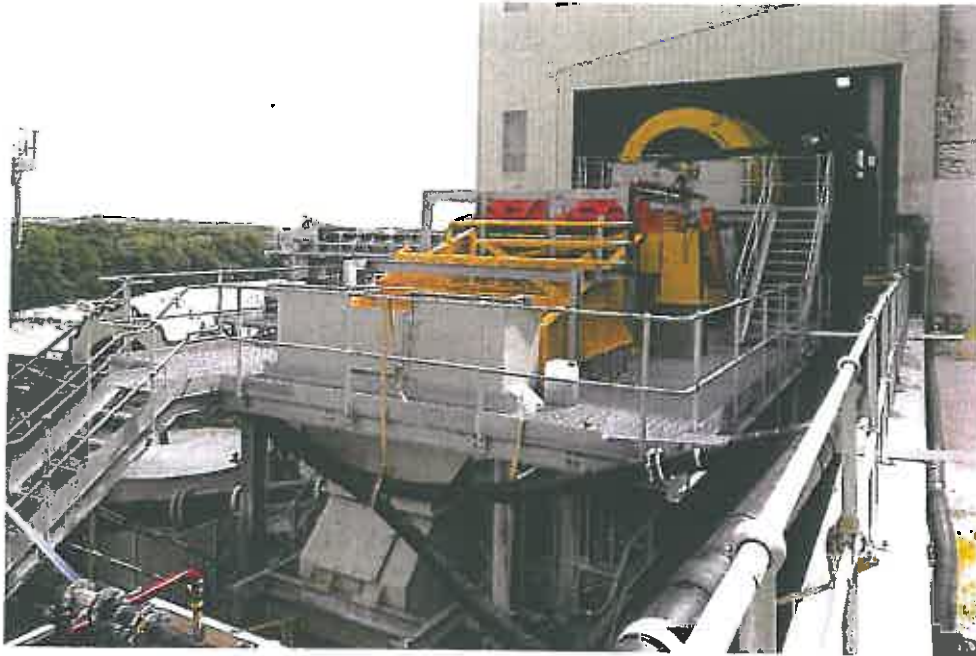
After washing the material is separated into gravel and finer fractions of clay, sand and mica

bays where stockpiles are built and then subsequently used during the night. This allows the plant to remain operational 24h a day.