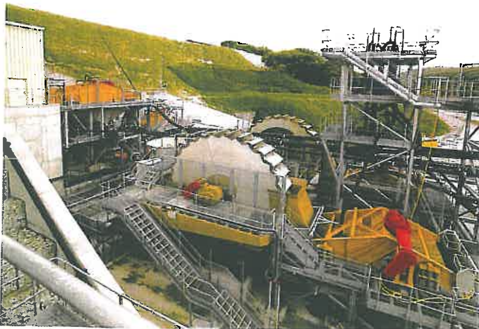
The sand-separation system comprises two bucket wheels and two dewatering screens

The underflow from the grizzly feeder is fed into a rotary washing barrel where the majority of the kaolin is released from the matrix. The rotational speed of the barrel can be changed depending on the type of matrix that is being processed. Semi-kaolinized material can be passed through the barrel fairly quickly, whereas a highly-kaolinized material requires more work input to release the kaolin. The mix stays in the barrel for approximately 60s, although this is adjustable to suit specific conditions through the use of a variable-speed drive. ➤